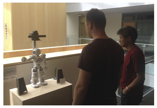
Figure 4: Directions Robot system.